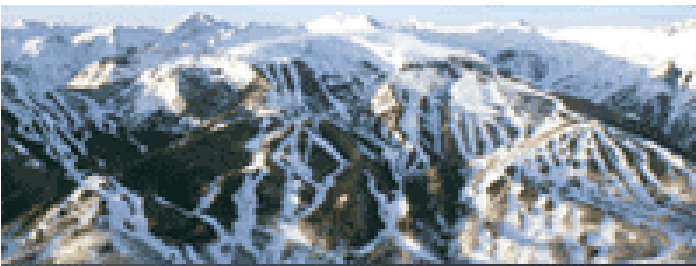
View of Snowmass trails